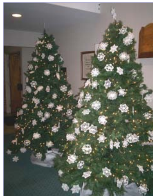
Please see page 7 for a complete list of ornament dedications.

honored and remembered as staff adorned the Madonna Manor trees with crocheted snowflake ornaments bearing each one's name. Nearly 250 ornaments graced the trees in loving tribute.